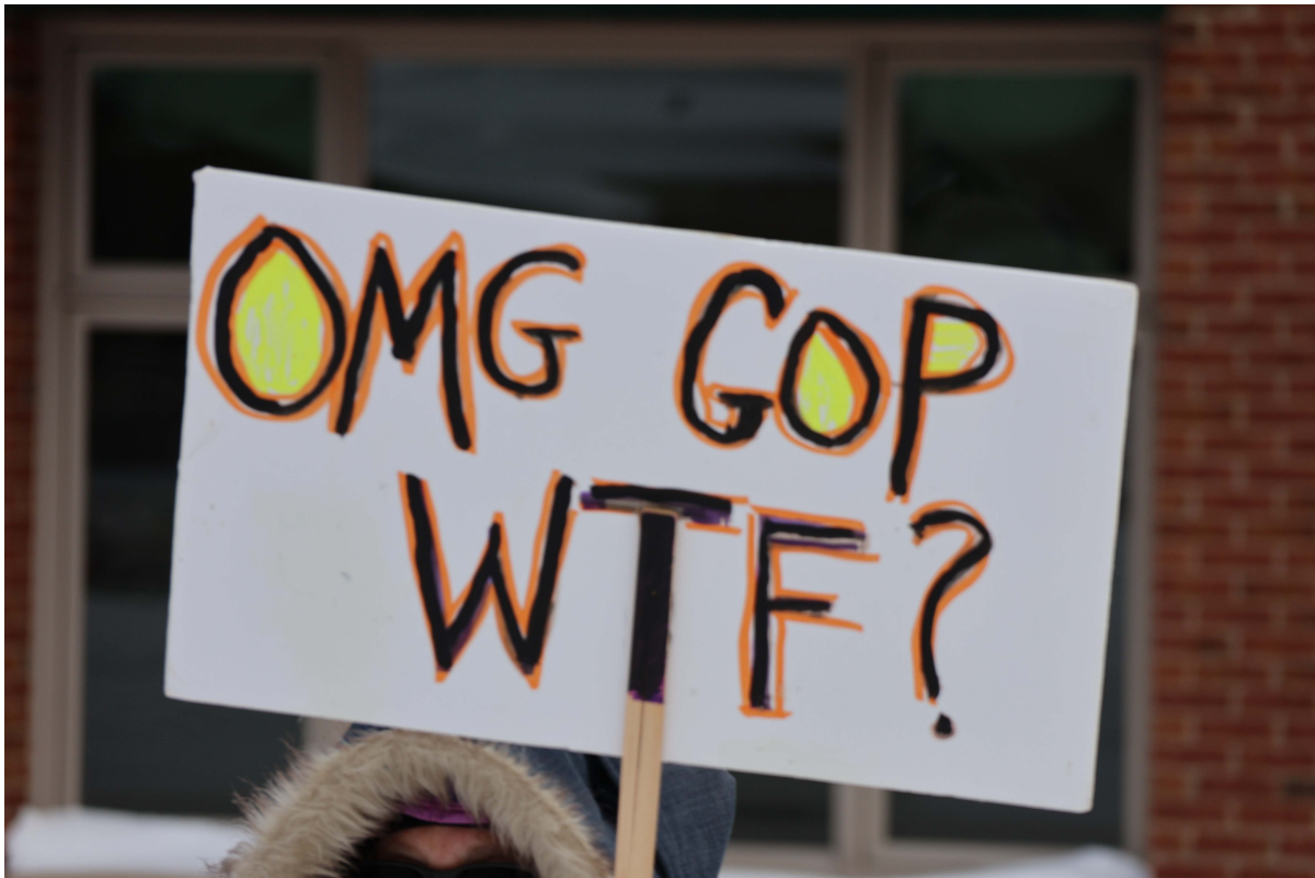
Figure 1: One sign expressing frustration with the total silence of GOP leaders to the killing of Alex Pretti.