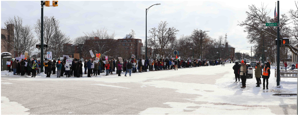
Figure 5: At 1:03, the crowd already extended from State Street to at least Sixth Street.

The march had a published start time of 1:00 PM and a published end time of 3:00 PM.