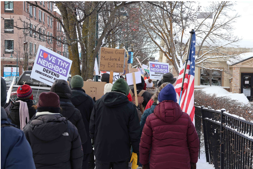
Figure 7: At 1:50, the crowd returning on State Street was very dense as it waited for the lights to change.