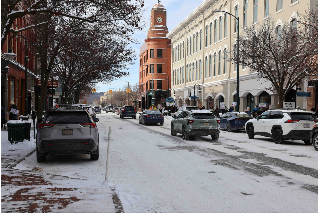
Figure 6: At 1:25 PM, the beginning marchers had already started returning on State Street, while new arrivals were turning on to Front Street. 1:25 PM time is taken from camera time, not the clock tower.