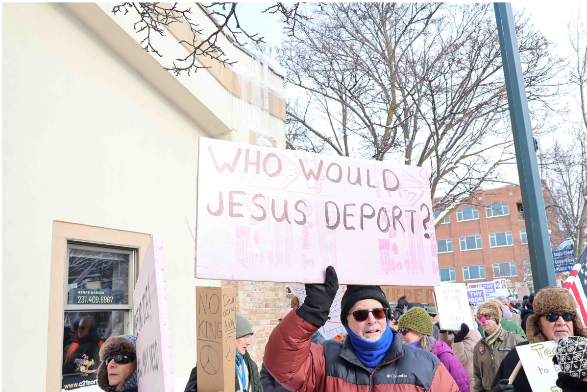
Figure 4: One marcher has a question for biblical scholars.