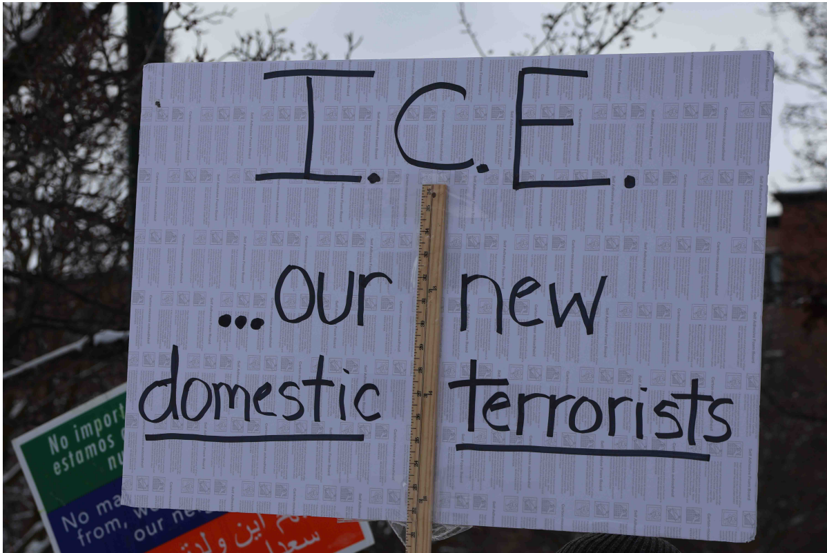
Figure 3: With two un-investigated killings of Minneapolis protesters, ICE is rapidly earning a reputation for state-sponsored terrorism.